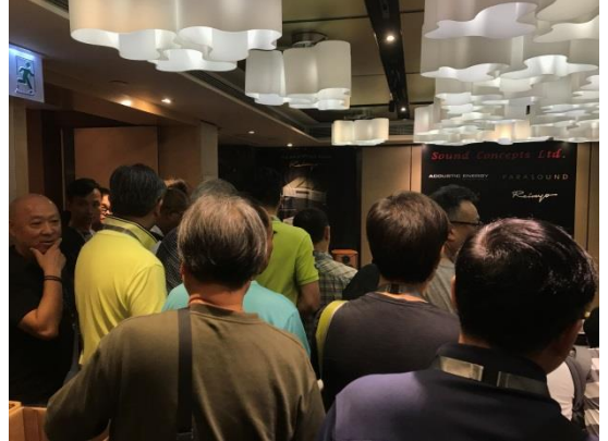
Photos taken in our room at the Royal Garden that it was crowded by serious music lovers for 3 days

Many people remember that they could enjoy listening to good music in our room at the Royal Garden last year as we demo the XRCDs with the full set of Reimyo System. Thus, many of them came back to find us as we played the “real music” to them.