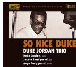
XRCD24-NT013 So Nice Duke Duke Jordan