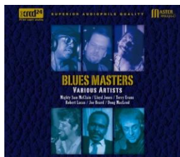
XRCD24-NT015 Blues Masters vol.1 Various Artists