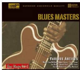
XRCD24-NT016 Blues Masters vol.2 Various Artists