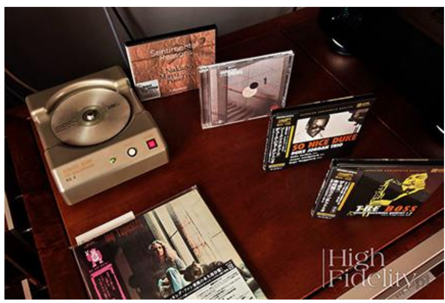
conditions and what needs to be conveyed to listeners.

for all markets in Japan, as well as the powerful performance of this instrument on the The Boss album, released by Mr. Kiuchi not only on vinyl, but also on the CD XRCD24, were presented in a way that was a generally accepted compromise between what is possible in home