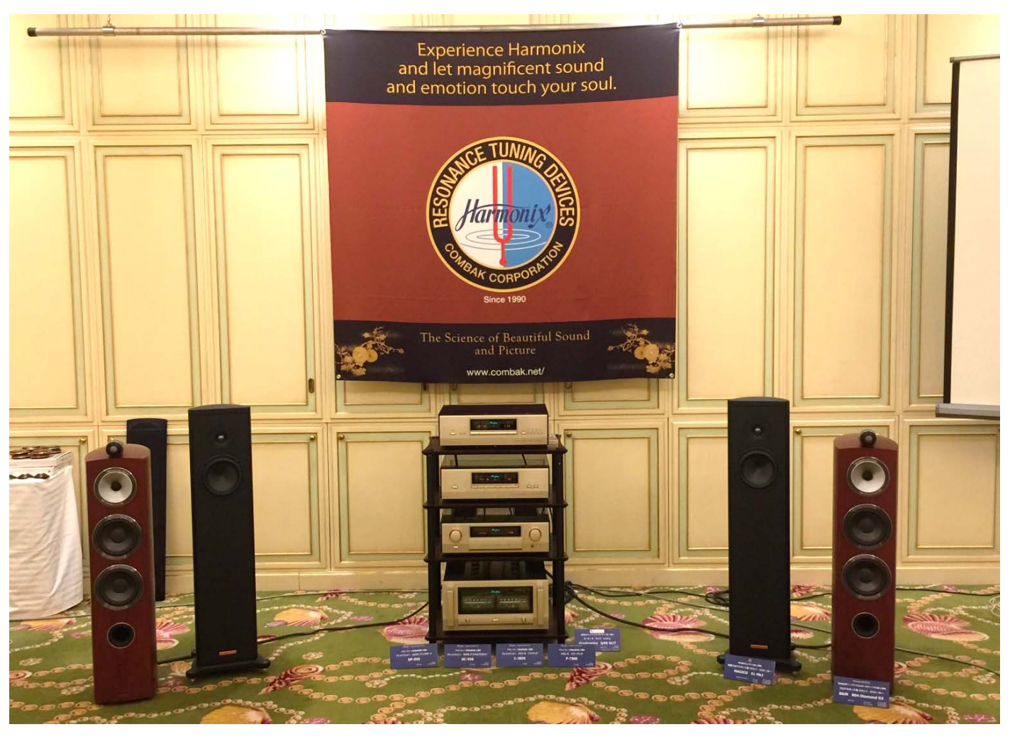
System used for the Tuning presentation

Four local manufacture and suppliers join us by supplying their electronics, speaker systems and System rack. If named they are Accuphase, B&W, Magico loudspeakers and Quadraspire. Aforementioned were used for the demonstration of music sources, Harmonix Tuning for electronics, speaker system and system rack.