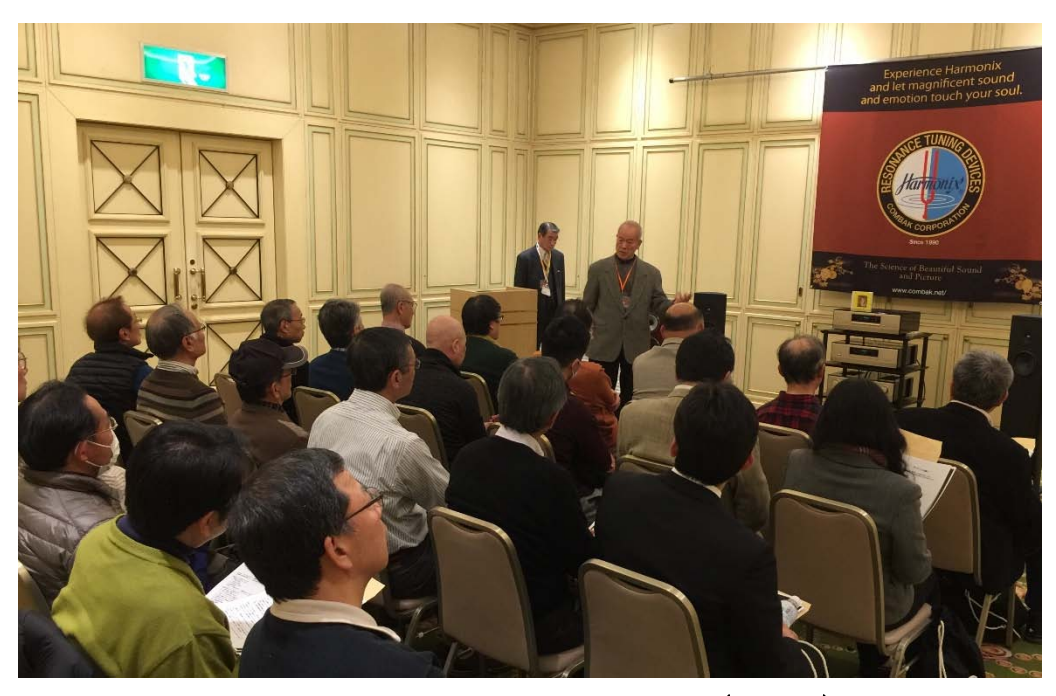
Sight of the presentation on February 19 (Sunday)