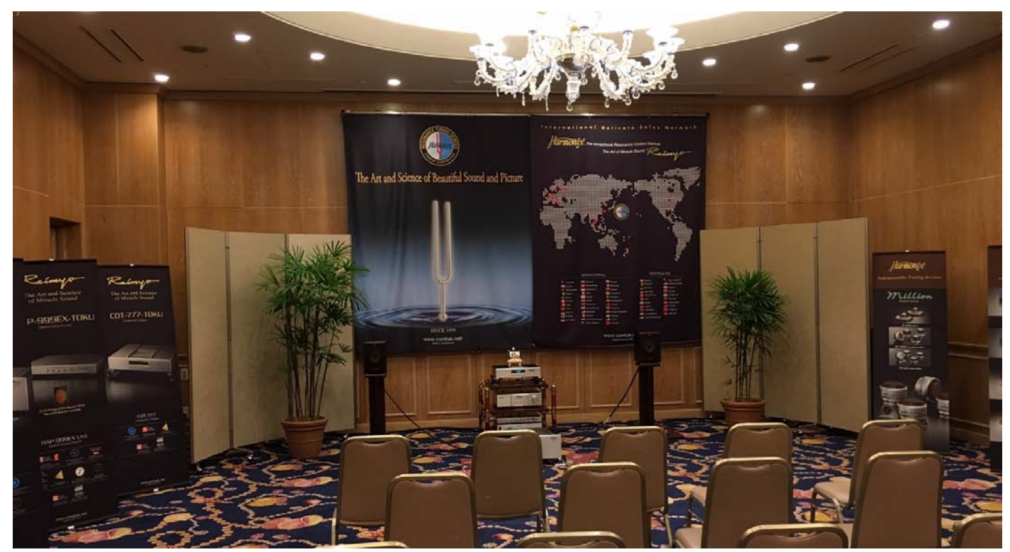
Reimyo system at Reception room

Two rooms were prepared for the presentation, one was designated for demonstration and seminar, and other room was as reception and display and sales for music soft and Harmonix, Hijiri and Reimyo where visitors can enjoy the sound of Reimyo system.