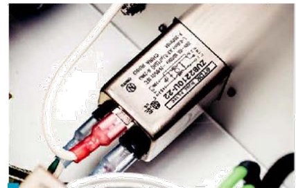
The noise from the mains is suppressed at input.

allows to easily fit it in a high-class audio stand – such as our Rogoz Audio 4SPB/ BBS. Its weight of 31.5 kg also doesn't pose any problems.