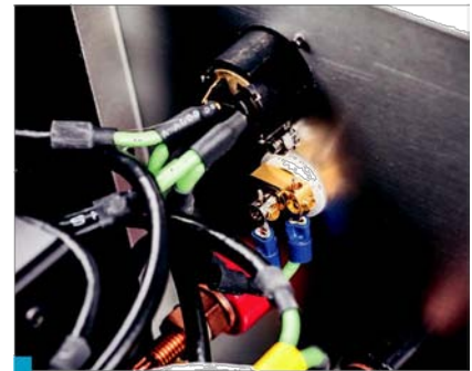
Attention to detail is also visible when you look at the connectors – truly amazing. The copper terminals are from Mundorf.