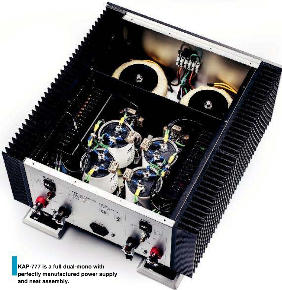
KAP-777 is a full dual-mono with perfectly manufactured power supply and neat assembly.