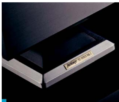
Harmonix TU-505EX aluminum and wood feet are quite an expensive accessory. Here we get them for “free”.